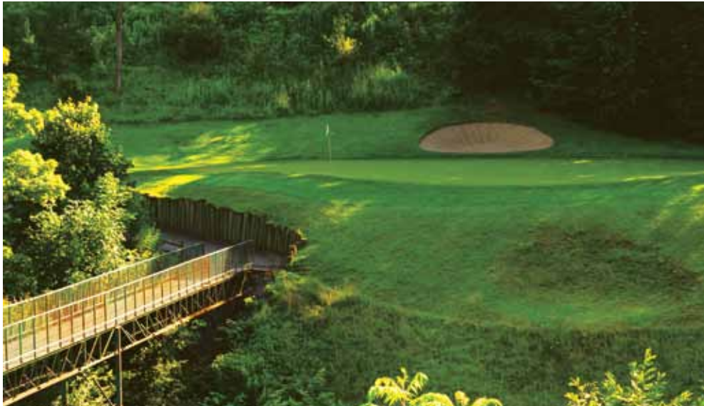
| The course climbs up and down thanks to changes in elevation |