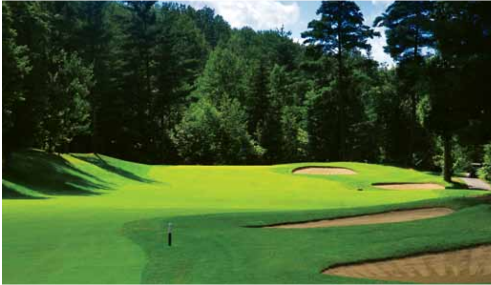
| Tree-lined fairways and greens add to the challenge of the course |