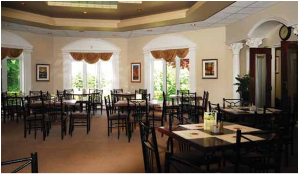
| The Bistro |