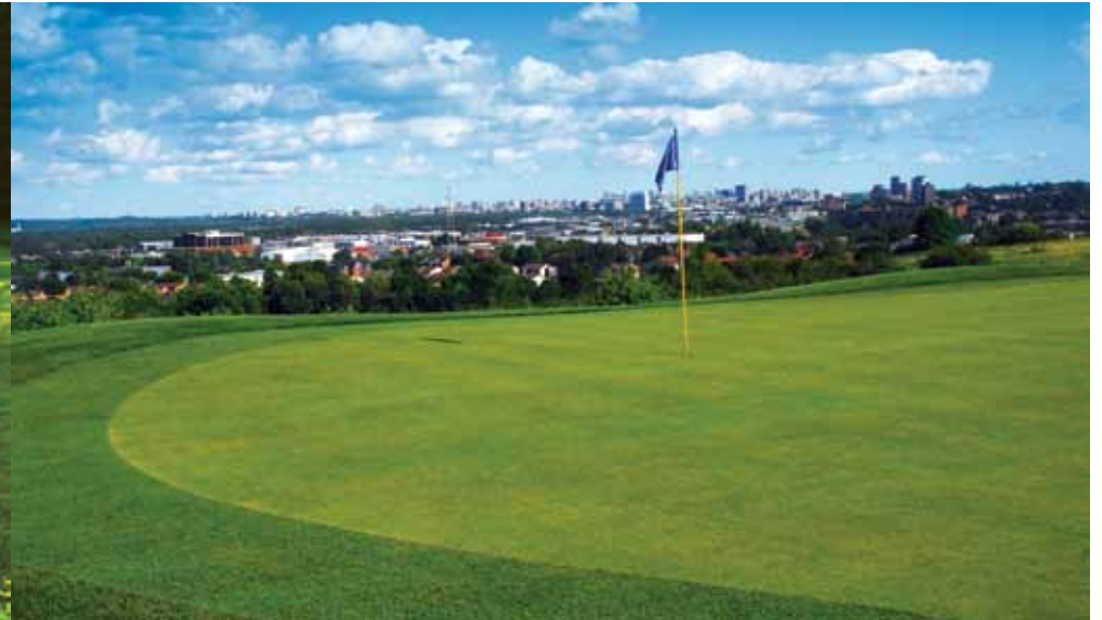
| The entire city of Ottawa can be seen from some of the holes |