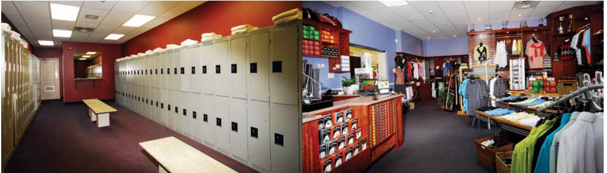
| Men's locker room |