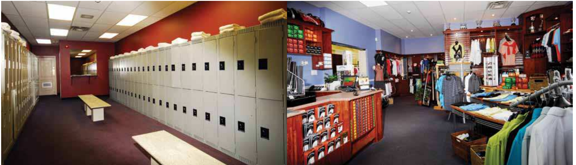
| Men's locker room |