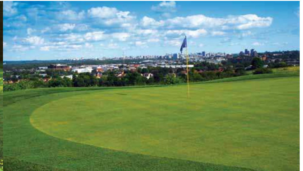
| The entire city of Ottawa can be seen from some of the holes |