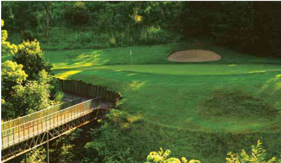
| The course climbs up and down thanks to changes in elevation |