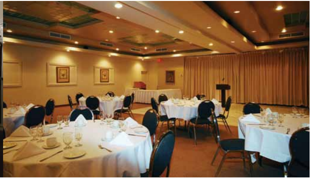
| Banquet facility |