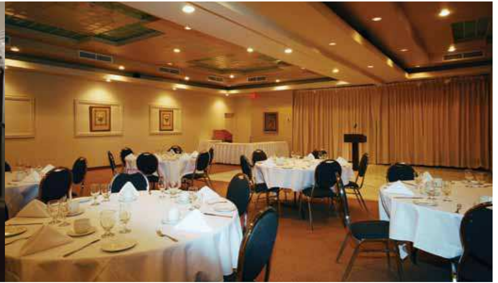
| Banquet facility |