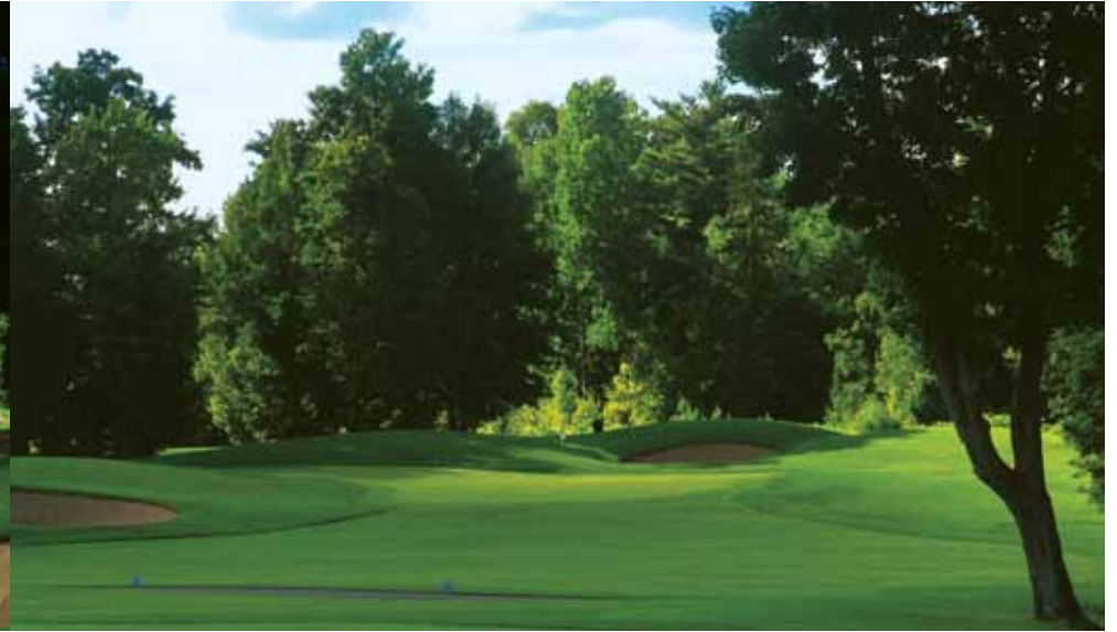
| Hautes Plaines offers a variety of par threes, fours and fives |