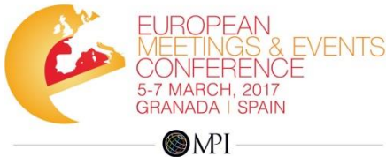
PICTURED ABOVE: Rendezvous in Granada & GBOT in Salobrena

The European Meeting and Conference was recently held in the beautiful city of Granada in Southern Spain. It was also the sight of the MPI